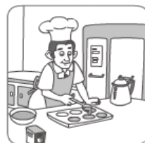
He is filling the mould with the batter.